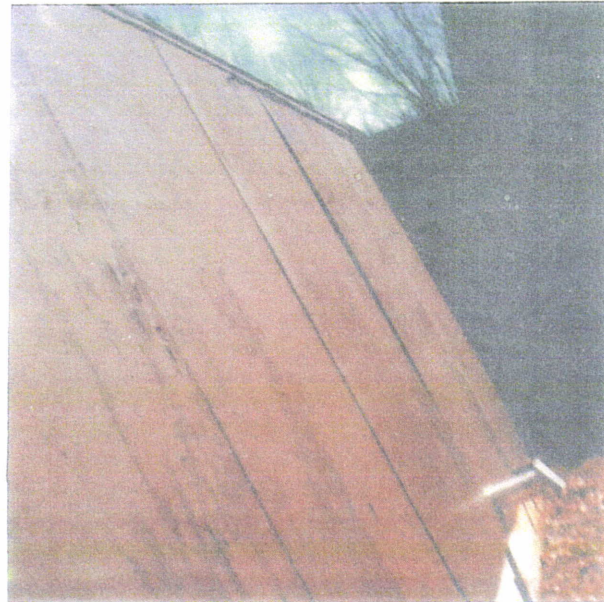
EXTERIOR FIREPLACE AND UTILITY/STORAGE FACILITY 1978