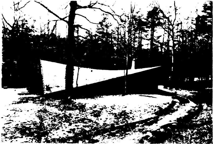
PLATE I (cont'd)